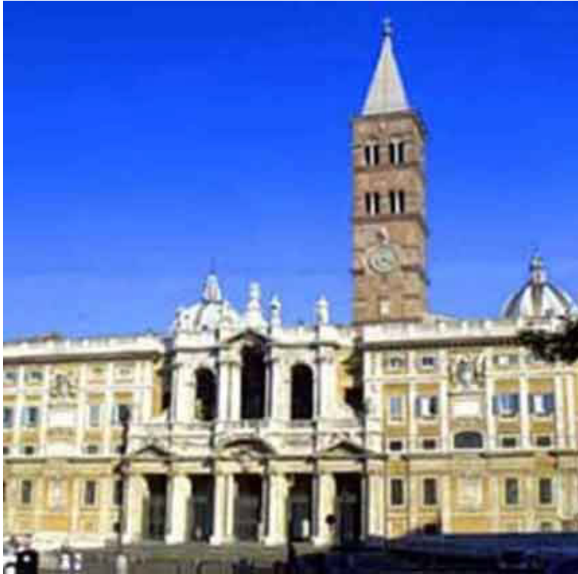
The Basilica of St. Mary Major ( The church of the snow )