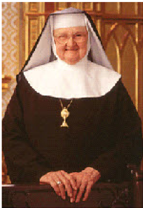
Mother Mary Angelica

The Eternal Word Television Network was founded in 1981, thanks to Mother Mary Angelica's determination, vision, and faith. Since that time, EWTN has grown to become the largest religious media network in the world. Through God's Divine Providence and the generosity of those who support EWTN's apostolic work by their prayers and donations, EWTN reaches around the world with the message of the Gospel and the teachings of the Catholic Church. In 1996, Mother Angelica hosted the first EWTN Religious Programme. She began by saying, "Welcome. I've been waiting for years for this." She continued her message by saying that EWTN also has a catalogue on show from which people can order good books, beautiful artwork, statues and rosaries to strengthen their and the faith of families and individuals.