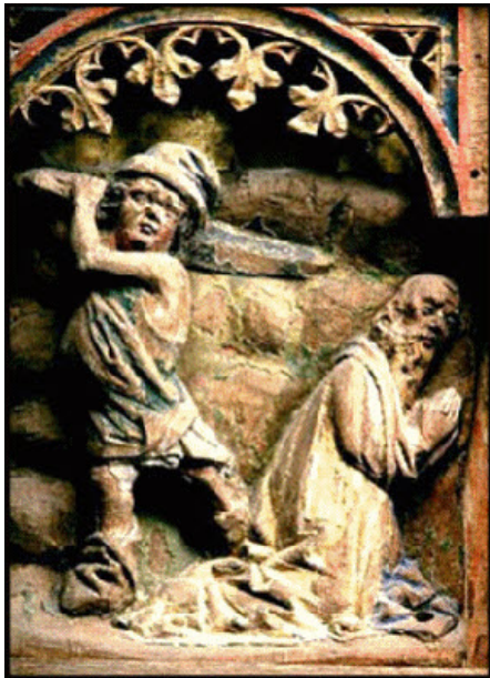
Beheading of St. Paul—a carving in a mediaeval cathedral

St. Paul was born in Tarsus, (modern Turkey). He was a Jew and was know as Saul. He was also a member of the Pharisees who hated and persecuted Christians. He was present at the death of St Stephen, of which he approved. On his way to Damascus to arrest one group of Christians, he was knocked to the ground and was blinded by a heavenly light. Jesus spoke to him and asked him : "Saul, Saul, why do you persecute me? He said "who are you Lord"? And the voice answered: "I am Jesus