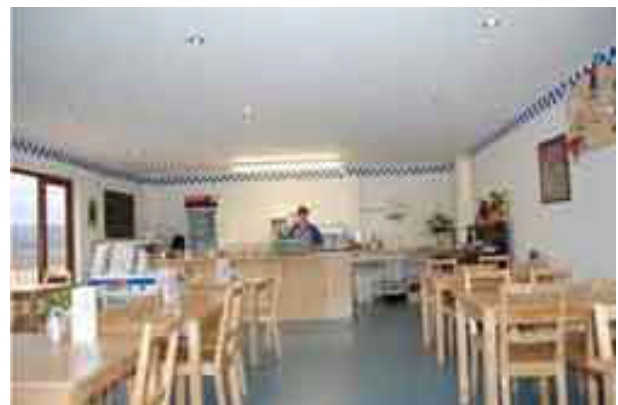
The colourful new restaurant