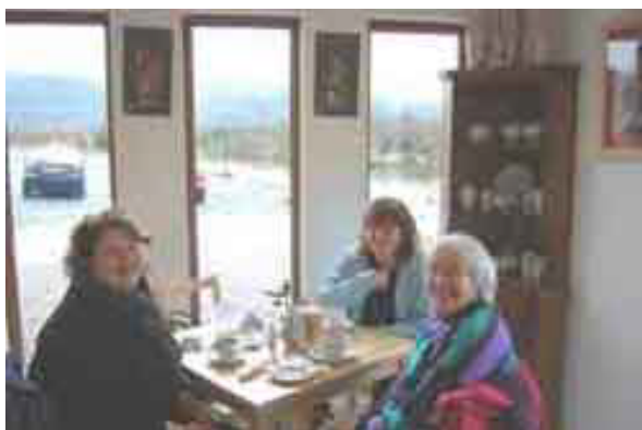
A group of visitors enjoying a morning coffee