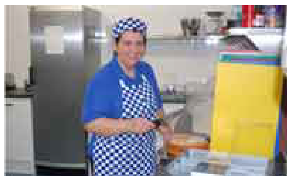
Slicing a delicious cream cake in the ultra modern kitchen